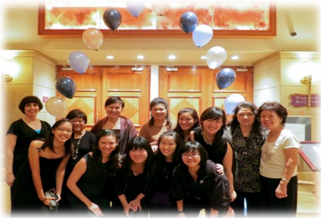
The organizing committee