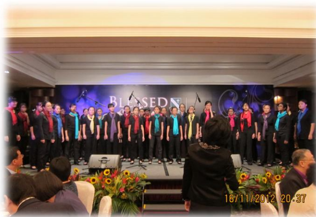
The SMSS Choir