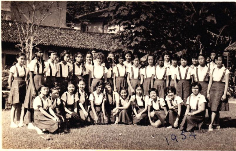
Class of 1954

It is hard to believe that so many years have passed, since I myself was a St Margaret's girl, and fast forward 50 years and here I am, standing right before you..... I present from my archives images class of 1954 and 1955