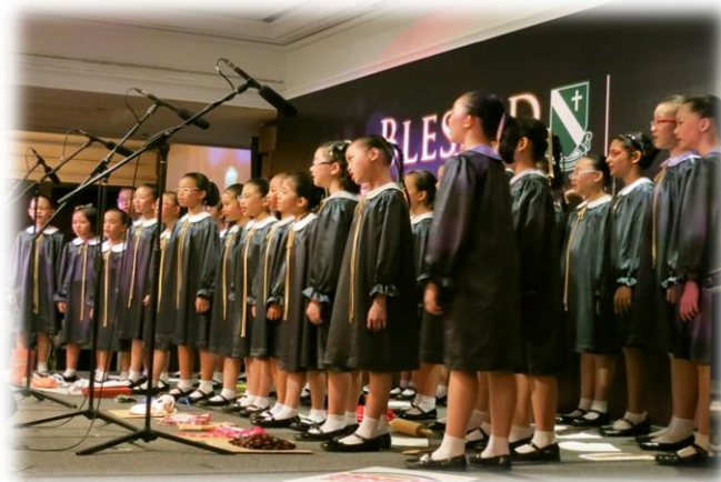
The SMPS Choir