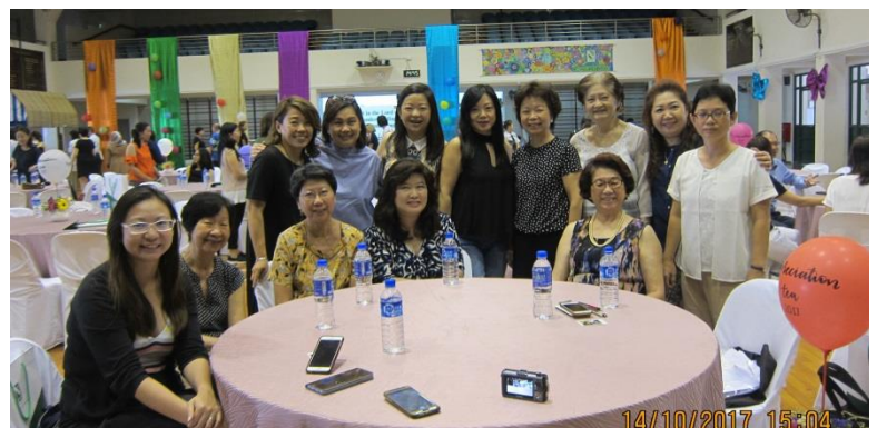
SMESA Board members at the tea

To honour the contributions and support of its partners in education, the Secondary School hosted an Appreciation Tea for its partners in the School Hall on 14 October 2017. SMESA's Board members were invited to the event. Guests were given some craft work (arranged by the students) to do and were also entertained with music played by the students.