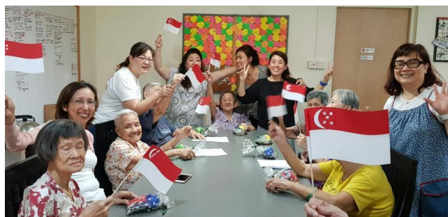
Bringing cheer to the elderly