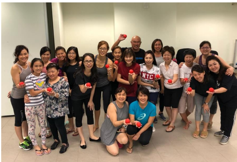
We had fun!