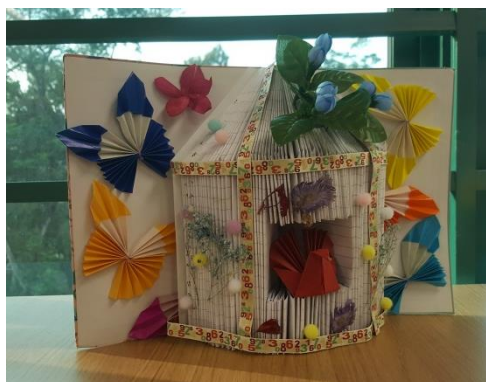
Bird cages galore!

It also did not take us that much time or effort to transform old books that we have read before into beautiful bird cages, though it might be back aching but the results turned out to be very nice."