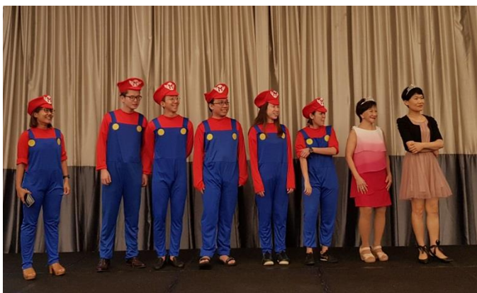
Our teachers .... Our superheroes!

The fun-filled celebration left everyone with smiles on their faces. The celebration proves that our teachers are superheroes indeed!