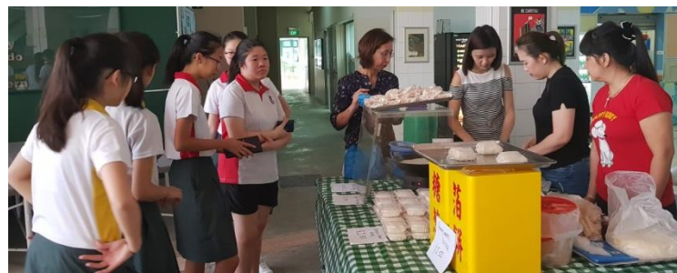
SMESA members manning the stalls