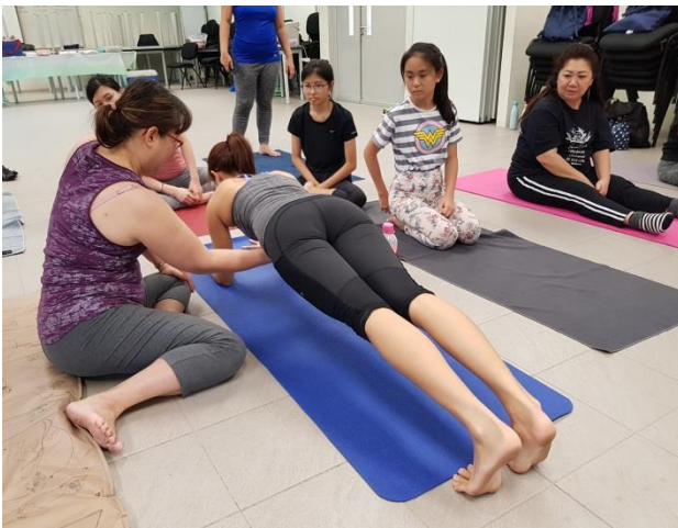
Strengthening of muscles

"It was a session not just to loosen the tense muscles but also to spend quality time with family and friends."