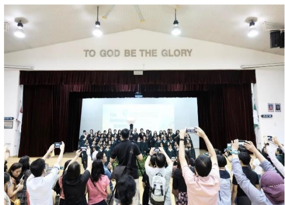
Friends and family capturing the moment as the graduands gathered