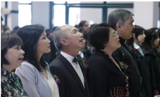
School leaders and guests