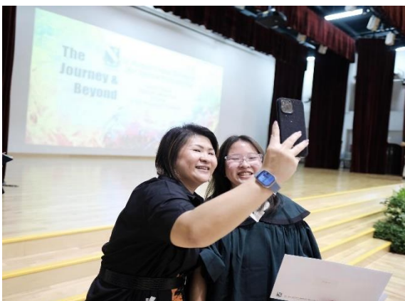
Proud parents taking pictures with their daughters