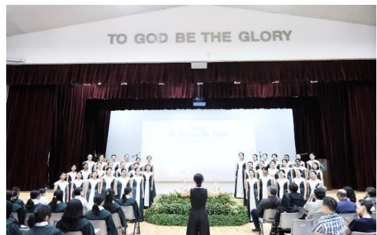
Performance by the School Choir