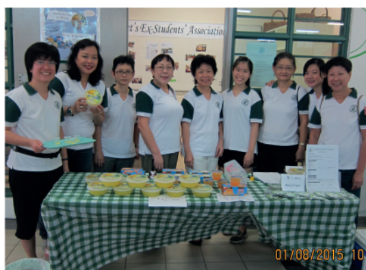
03 Cool and refreshing jelly for sale